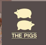
Spa suite at The Pigs