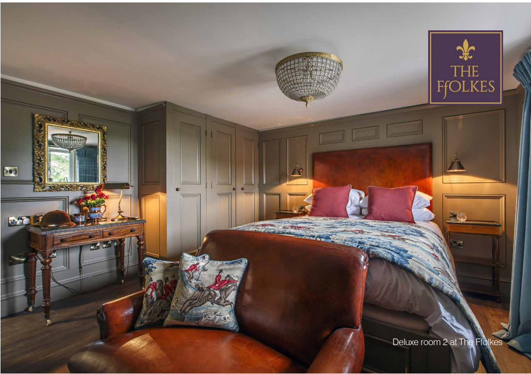
Deluxe room 2 at The Ffolkes

Courtyard rooms sold on a first come first serve basis.