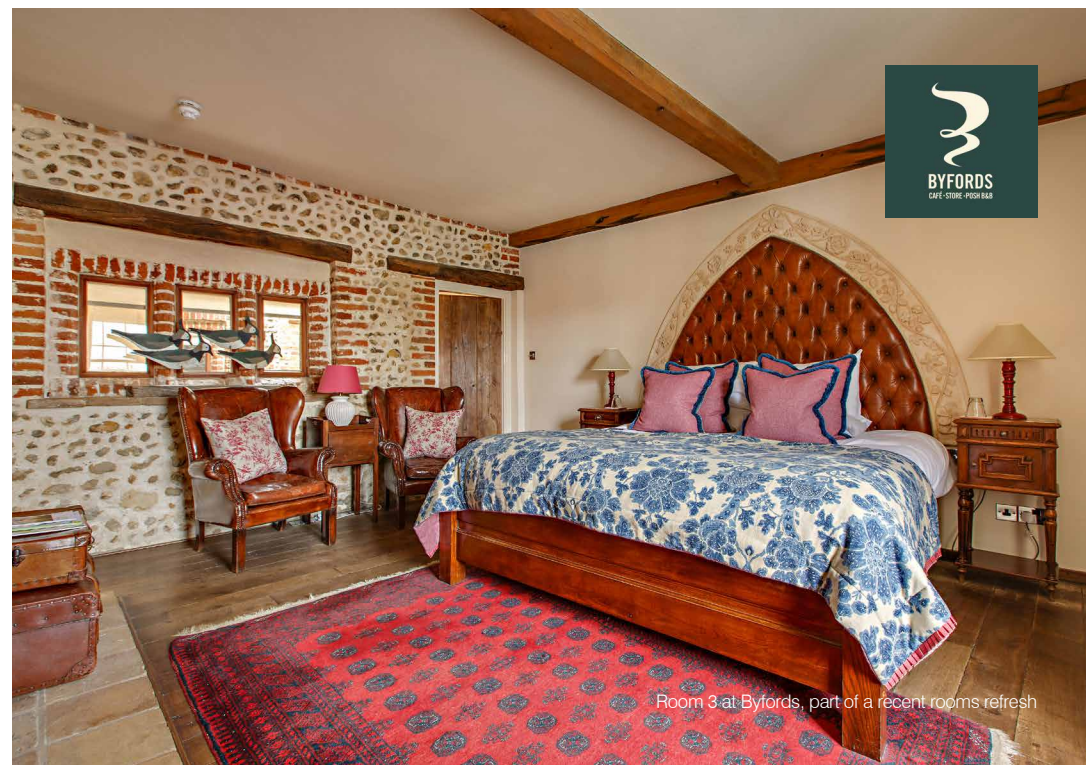
Room 3 at Byfords, part of a recent rooms refresh

Afternoon tea on day of choice. Served 3–5pm.